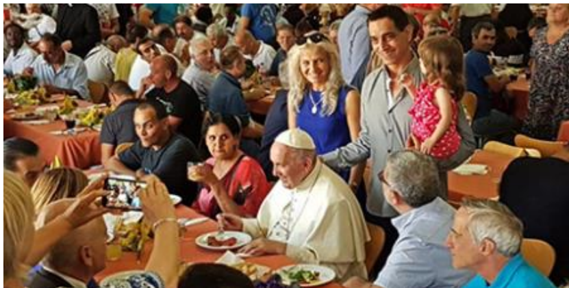
Pope Francis dines with the poor and homeless on Friday